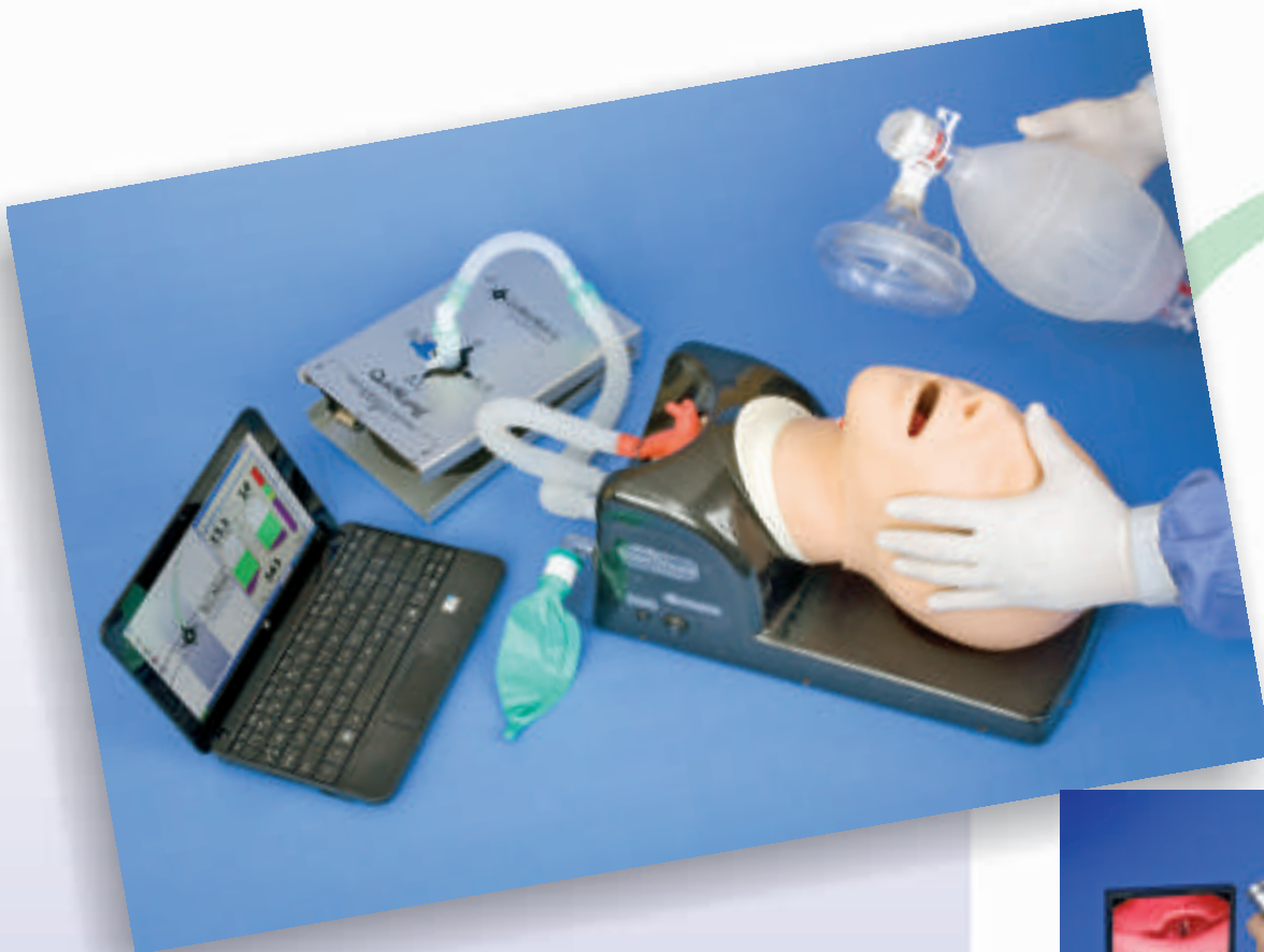
ETView Option: video feedback for intubation