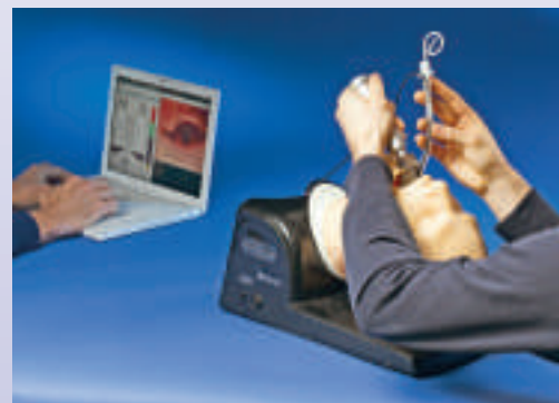
ETView image on the monitor helps the instructor coach and assess intubation technique.

RespiTrainer Basic – Equipped with a full face training head for bag-mask ventilation only (no intubation). Get the benefit of RespiTrainer performance feedback at a lower cost.