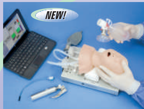
RespiTrainer Infant can also be used with ETView